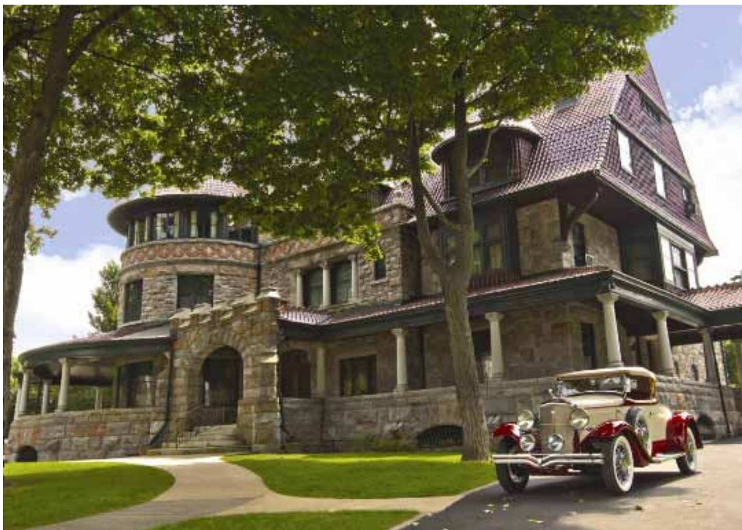
Copsaholm - The Oliver Estate in South Bend, Indiana