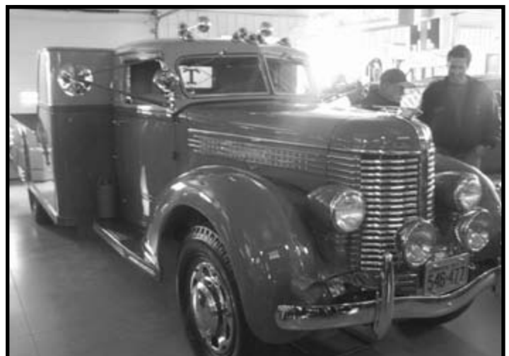
1938 Diamond T tractor hauler has modern Cummins power