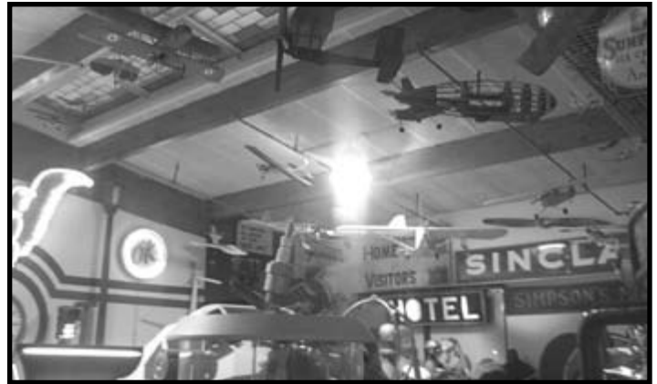
Aircraft of all scales, from small to real size come from every direction at Dort Mall