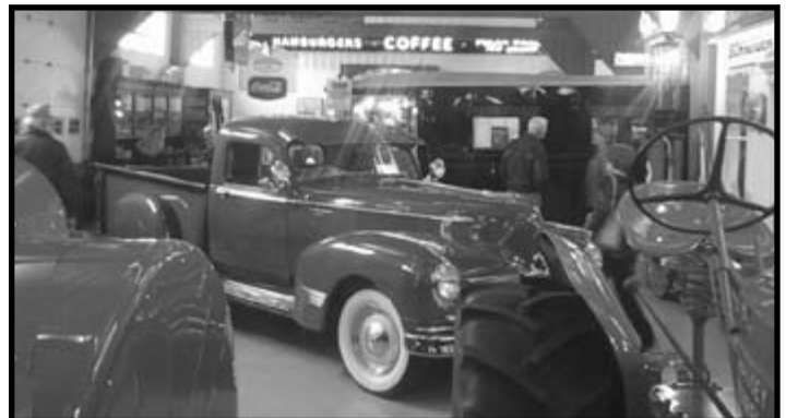
Restored '47 Hudson pickup nestled among the tractors and signs at the Schneider's collection