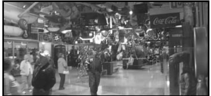
KAARC club members sorting out the Dort Mall collection